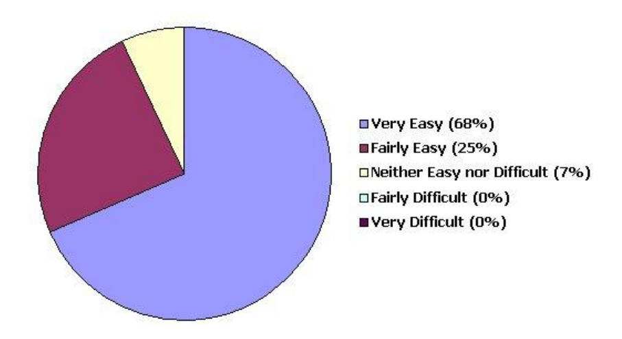
Figure 5 – Ease of access and play

As could possibly have been expected in the age of the "digital native", there were no students who had any problems in accessing or listening to the files (see Figure 5 )