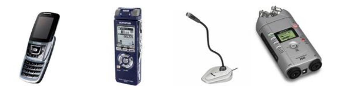
Figure 1 – range of sound recording devices available

A range of key decisions needed to be made before the project could begin, particularly with regard to equipment, standards and training. In terms of recording staff feedback, the choice of equipment was narrowed down to four options: mobile phone devices, digital dictaphones, digital microphones and digital sound recorders (see Figure 1 ). For reasons of both quality of sound recording and compatibility of files (MP3 format was agreed as a standard - Rotheram, 2009b: p2), it was decided to offer staff the choice of using either a digital microphone with recording software (Audacity) or a digital sound recorder (the department already had access to several H4 Zoom recorders).